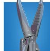
needle nose jaws

© Sept. 2018 Sensor Networks, Inc. All rights reserved. JAWS 2.0 is a trademark. Patent pending.