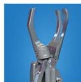
fork & tine