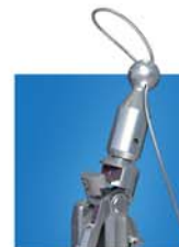
snare with adapter