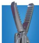
flat serrated jaws