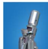
magnet with adapter