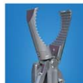
curved serrated jaws