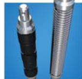
rubber & spring flex joints