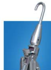
hook with adapter