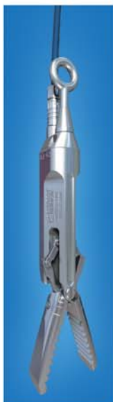
hoist lifting ring