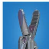
short serrated jaws